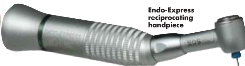
Endo-Express reciprocating handpiece