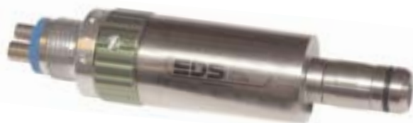
Endo-Express E-Type, 4-hole air motor